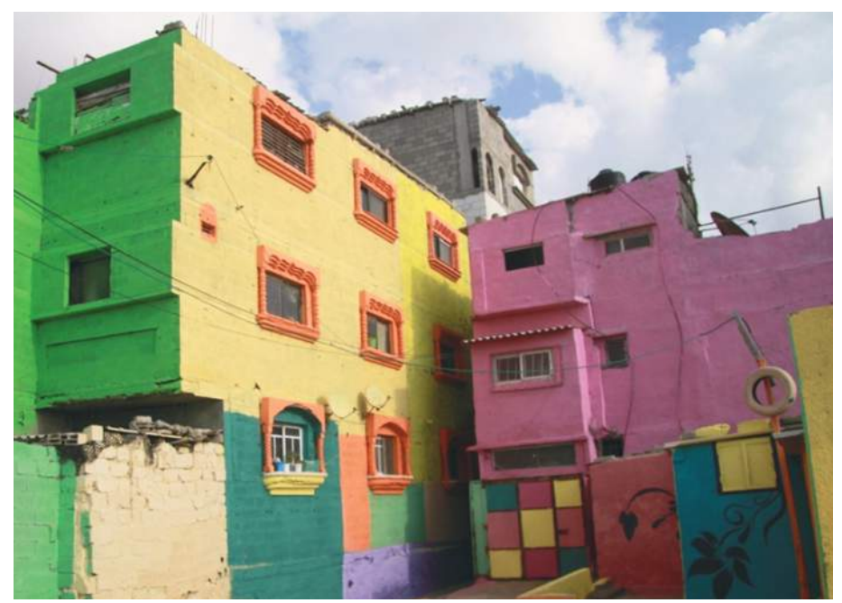
Top: A child from Al Shati' refugee camp after seeing his neighborhood has become colorful

Gaza Ahla (Prettier Gaza) initiative, in which we volunteered to paint and redecorate Al Shati' refugee camp