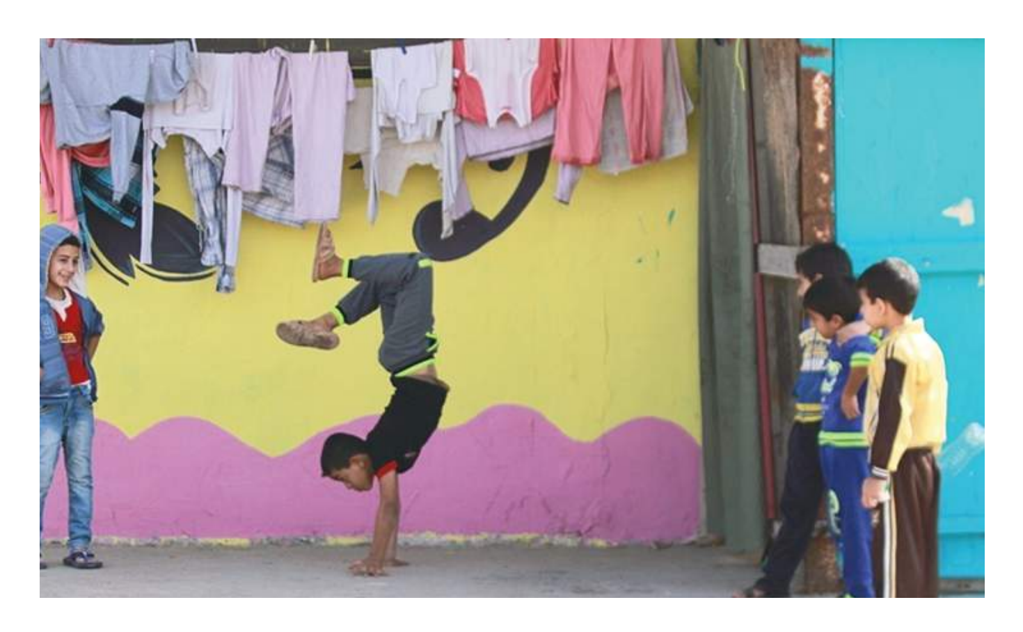
A group of children from Al Shati' refugee camp playing after participating in painting their houses during Gaza Ahla initiative.

Gaza Ahla (prettier Gaza) initiative, in which we volunteered to paint and redecorate Al Shati' refugee camp. The image depicts one of Gaza's poorest residential neighborhoods.