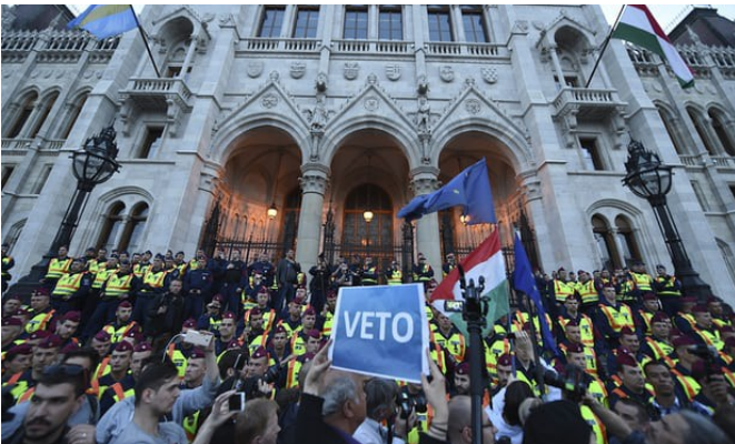
Protesters demonstrate against Orbán's education changes, outside the Central European University, founded by Soros.

Soros grew up in Hungary as a child and he survived the Nazi dragnet and deportation to Auschwitz. As a result of his experiences, which include the notorious collaboration between the Hungarian Zionists led by Rudolf Kasztner and the Nazi butchers under Eichmann, Soros became a non-Zionist.