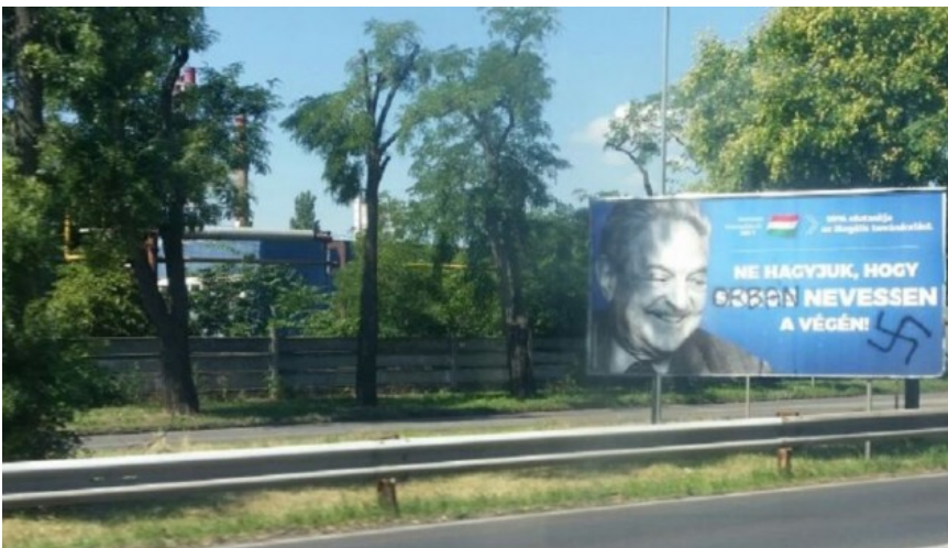
An anti-Soros billboard with a swastika and Soros's name replaced by Viktor Orban's, seen in Budapest, on July 17, 2017.

... I have often been a prophet in my life and was generally laughed at. During my struggle for power, the Jews primarily received with laughter my prophecies that I would someday assume the leadership of the state and ... then, among many other things, achieve a solution of the Jewish problem. I suppose that meanwhile the then surrounding laughter of Jewry in Germany is now choking in their throats.'