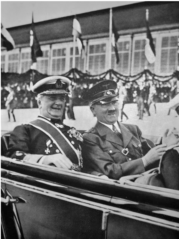
Admiral Horthy and Hitler