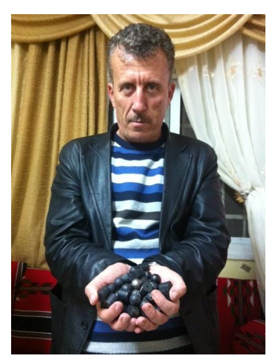
Bassem Tamimi, a human rights defender, holding rubber-coated bullets fired by Israeli forces after demonstrations in his village, Nabi Saleh.