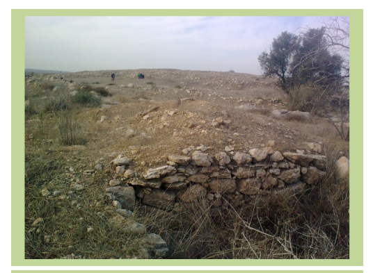
The remains of the village of Ajjur. Residents were evicted in 1948 and today live in refugee camps. With funding from JNF UK, this land became 'British Park', with Jewishonly settlements.

Zionists claim to speak on behalf of all Jews and therefore accuse opponents of Zionist organisations like the JNF of anti-Semitism. This is nonsense. Zionists want an ethnically pure Jewish state and believe that Palestine should belong to the Jews alone. Many Jews resent this and campaign against Zionism.