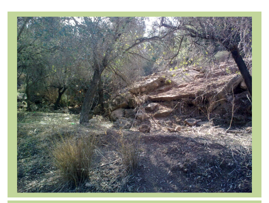
A bulldozed Palestinian home in the destroyed village of 'Imwas', now in 'Canada Park', illegally annexed by Israel in 1967.

The JNF now owns 13% of Israel's land and controls a further 80% through statutory representation on the Israel Land Authority. Almost all of Israel is therefore subject to its ethnic exclusion policy.